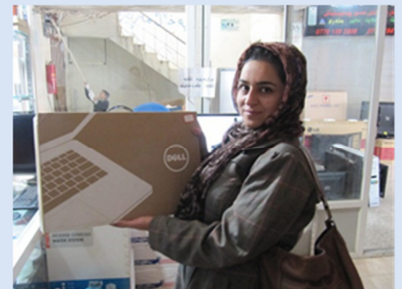
The proud new owner of a laptop.

"For me, life in Germany was full of difficulties [...] my asylum application was rejected. I couldn't get a chance to study [...] or get a job. I also started facing problems with my husband."